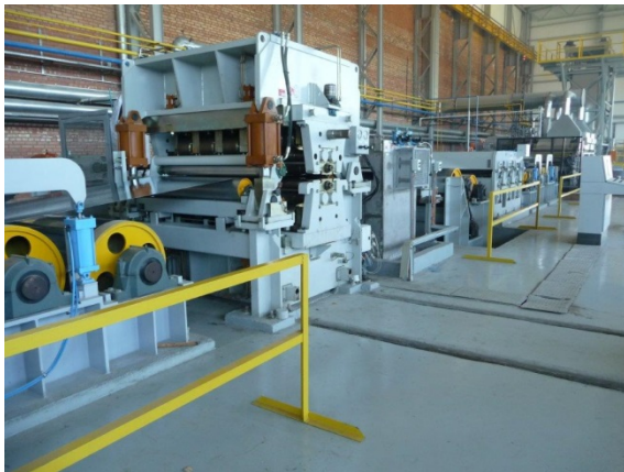
A MILL AND LEVELLER COMBINATION

Together the tension leveller and the mill provide the ability to produce a high quality product for post painting operation.