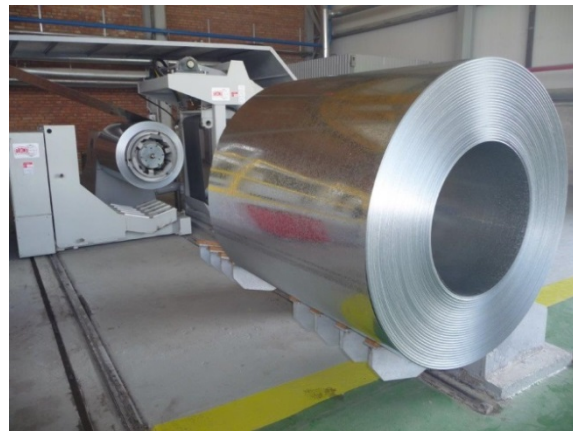
GALVANIZED COIL FROM A BRONX WET FLUX LINE

Wet Flux galvanizing is an economical choice for achieving a quality galvanized product. The combination of proven technology and equipment delivers the desired outcome.